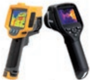
Thermal Imaging Cameras & Thermal Imaging Training www.thermalimagers.ie