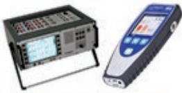
Substation Testing & Monitoring