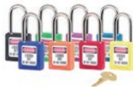
Lockout Tagout Equipment www.lockoutsafety.com