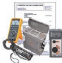
Calibration & Repair www.calibrationlab.ie