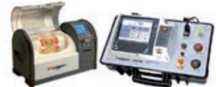
Transformer Testing www.powerpoint-engineering.com