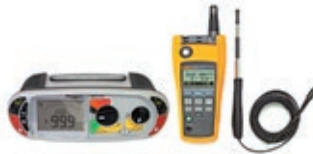
Electrical Test & Measurement Instruments www.powerpoint-engineering.com