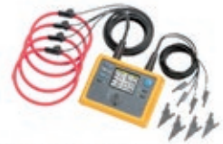
Power Quality & Energy Monitoring Products & Services www.powermeters.ie