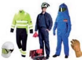
Arc Flash Protection www.arcflash.ie