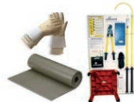
Substation Safety Equipment www.substation-safety.com