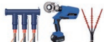
Cable Jointing & Tooling www.powerpoint-engineering.com