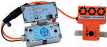
Cable Test & Fault Location www.powerpoint-engineering.com