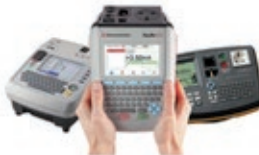
PAT Testers & PAT Training www.pat-testers.ie